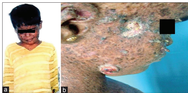
Figure 1: (a) Photograph of the patient of xeroderma pigmentosum at first visit. (b) Nodular lesion over right mandibular region and right temple with multiple freckles and verrucous lesions

The authors certify that they have obtained all appropriate patient consent forms. In the form the patient(s) has/have given his/her/their consent for his/her/their images and other clinical information to be reported in the journal. The patients understand that their names and initials will not be published and due efforts will be made to conceal their identity, but anonymity cannot be guaranteed.