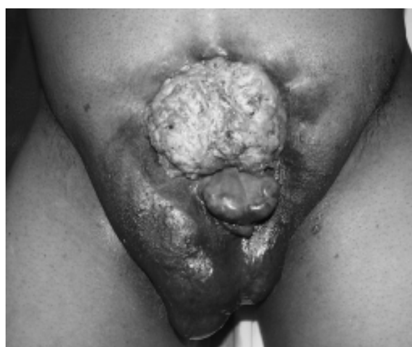
Fig 1: pre-operative photograph showing tumour

exstrophied bladder, progressive in nature about 1-year prior to the presentation (fig. 1); It had started bleeding at the time of presentation.