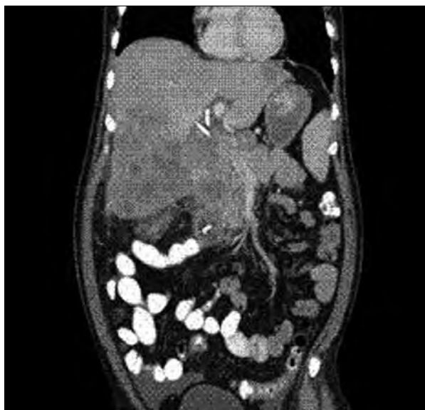
Figure 1: CT abdomen (coronal section) showing a large caudate lobe liver mass involving the gall bladder and common bile duct at porta with intrahepatic biliary radical (IHBR) dilatation

Autopsy series have demonstrated that metastasis to the gallbladder may occur in 4 to 20% of the patients with melanoma. Despite this statistic, it is rare for metastatic melanoma involving the gallbladder to cause symptoms during life. [6] As a result of the rarity of gallbladder melanoma cases, the diagnosis is often not suspected preoperatively. [7] Ultrasonic features may help to diagnose melanoma metastases preoperatively. Metastatic melanoma of the common bile duct (CBD) is very rare, with only 18 cases reported so far; [8] the most common presentation in these cases is of progressive painless obstructive jaundice