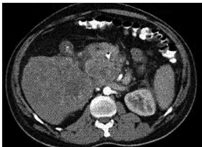
Figure 2: CT abdomen (Transverse section) showing a large caudate lobe liver mass involving the gall bladder and common bile duct at porta with IHBR dilatation