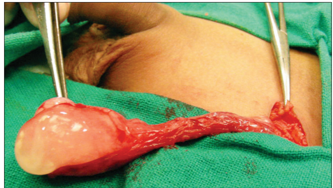
Figure 2: Gelatinous material with yellowish-white flakes on incising the testis