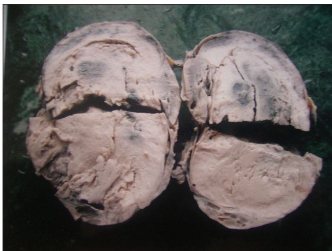
Figure 1: Clear cell sarcoma of the kidney. The gray-tan tumor is large, soft focally cystic and necrotic