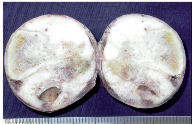
Figure 1: Well-encapsulated spherical mass showing grayish white cut surface with necrosis and cystic change

Nephroblastoma or Wilms' tumor is the commonest malignant tumor of children occurring between 2 and 5 years of age, arising from embryonic kidney tissue. Extrarenal nephroblastomas are exceedingly rare retroperitoneal tumors without involving the kidneys. Extrarenal nephroblastomas vary in their clinical presentation depending on their location and pressure effects on bowel, bladder, ureter, blood vessels, and nerves. Other sites of occurrence are inguinal region, endocervix, uterus, epididymis, ova testis and any place in retroperitoneum along paravertebral area have been described. [2] The histogenesis, morphology, clinical staging,