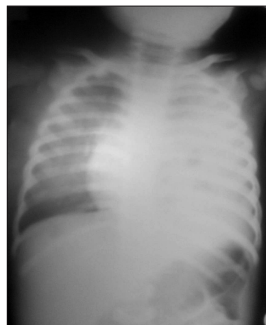
Figure 1a: X ray chest showing left sided pleural effusion.

Enteric fever caused by Salmonella group of organisms is an endemic infection in India with more than 0.3 million cases occurring every year. [9] It has been reported to occur in 10–20% of children less than 2 years of age. [11,10] Usual symptoms in children less than 2 years are fever (100%),