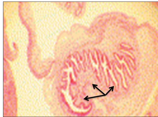
Figure 4: Cystic cavity containing cysticercus cellulosae larvae (H and E, 10x)

lives in small intestine of man measuring 2-3 m in length with 800--900 proglottids. Each gravid segment contains about 50,000 eggs. The worm sheds gravid segments with eggs in the stool infecting pig and man. On reaching the alimentary tract of pig, the eggs rupture, liberating the oncospheres which penetrate the gut wall and reach the systemic circulation. They dislodge into different organs and muscle developing into larvae. Human beings are infected by eating raw contaminated pork containing cysticerci, which develops into adult tapeworm in the jejunum. Autoinfection may also occur by contaminated fingers or direct contact with another human carrier. [5,7] The worm sheds gravid segments laden with eggs in stool, reinfesting pigs and thus completing the cycle. These are partially digested in stomach, evolving to oncospheres and subsequently penetrate small intestine mucosa to disseminate throughout the body via arteriovenous and lymphatic channels. The clinical manifestations depend on location and number of cysticercosis at particular site. Intestinal infection by Taenia solium could be asymptomatic or may present with epigastric pain, nausea, and loose motions. In the case of neurocysticercosis, a patient presents with seizures and the other symptoms are related to the location and pressure caused by cysticerci in particular the region of the brain. Oral and subcutaneous