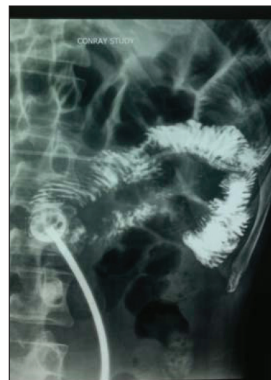
Figure 3: Contrast study of repeat DPEJ done on 14/06/2013