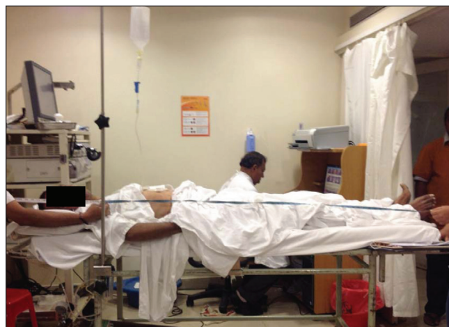
Figure 1: A 6-ft tall patient

At our hospital, we initially attempted to insert PEG with Olympus GIF H180 gastroscop, but it failed because optimal transillumination and finger indentation could not be obtained