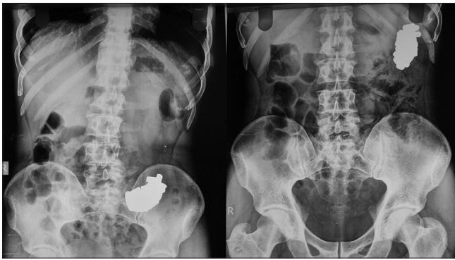
Figure 1: Abdominal X-ray confirming the presence of foreign body