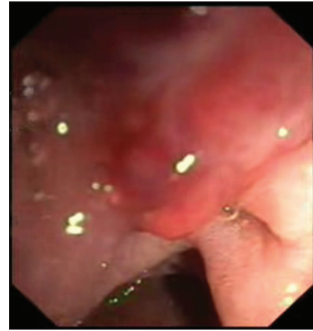
Figure 3: Endoscopy image showing inflammatory area in duodenal bulb