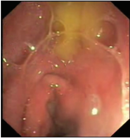
Figure 2: Endoscopy image showing pus in duodenal bulb