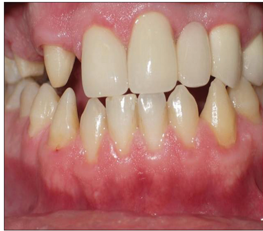
Figure 1: Intraoral view of the first case