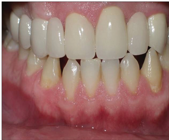
Figure 4: Final restoration of the first case

and root segments were extracted atraumatically. The patient did not want a new all-ceramic bridge restoration, and he also did not consent to implant-supported crown restoration for economic reasons. In addition, he wanted a quick, esthetic, and cost-effective solution for his missing tooth. Healing was evaluated 14 days after the extraction and the Turkom-Cera [Turkom-Ceramic (M) Sdn. Bhd.] all-ceramic crown restorations were removed from the right central and left lateral incisors for addition of a pontic [Figure 6]. Crown restorations were inserted again on the prepared tooth and fixed with light-bodied elastomeric impression material [Oranwash L, Zhermack SpA, Badia Polesine (RO), Italy] [Figure 7]. An impression of the maxillary arch was made with irreversible hydrocolloid impression material (CA 37; Cavex Holland BV) using a stock tray [Figure 8]. Casts were