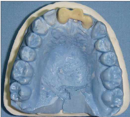
Figure 10: Addition of a new pontic to the Turkom-Cera cores