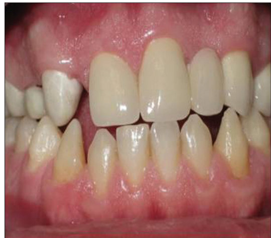
Figure 2: Intraoral view of 3-unit Turkom-Cera fixed partial denture framework