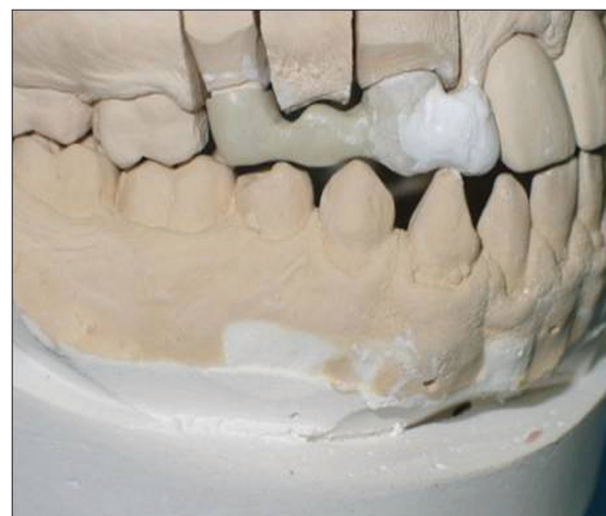
Figure 3: Addition of a new pontic to the Turkom-Cera framework with alumina gel

glass infiltrated according to the manufacturer's instructions [Figure 3]. The fit of the new framework was verified intraorally and veneered with