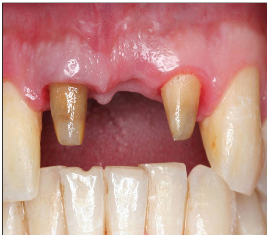
Figure 6: Intraoral view of the second case 2 weeks after extraction of the maxillary central incisor