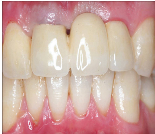
Figure 11: Final restoration of the second case