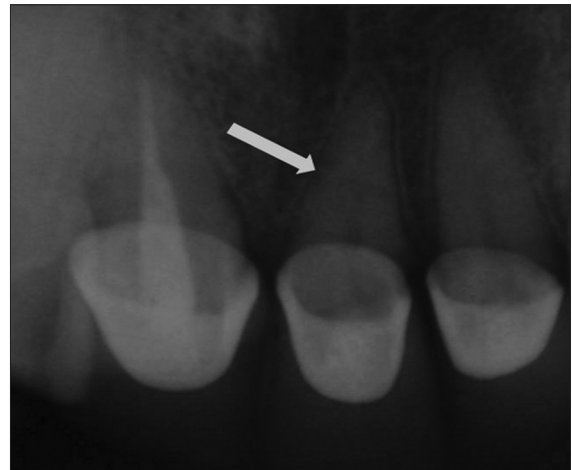
Figure 5: Radiographic view of root fracture of the maxillary left central incisor