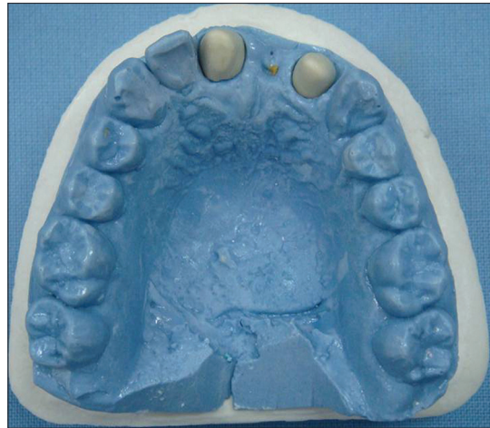
Figure 9: Veneering porcelains of crown restorations were cut off from the cores