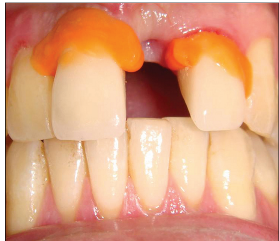
Figure 7: Turkom-Cera crowns were fixed with light-bodied elastomeric impression material