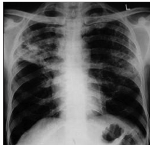
Figure 1d: Chest radiography revealing bilateral upper-lobe infiltrates suggestive of tuberculosis