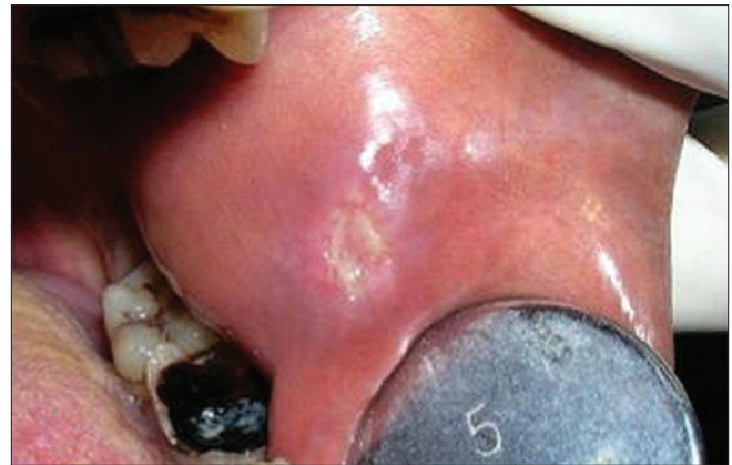
Figure 1b: Left buccal mucosal ulcer covered with pseudomembrane

Primary tuberculosis presenting as oral lesions are uncommon, since factors like an intact oral mucosa, salivary enzymes, and tissue antibodies act as barriers