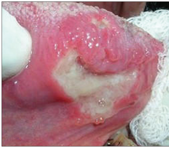
Figure 1a: Tongue ulcers- a larger ventral ulcer and a smaller ulcer superiorly, both with undermined edges

Provisional diagnoses of squamous cell carcinoma and lichen planus were given for the lesions of the tongue and buccal mucosa, respectively. Incisional biopsy from the edge of tongue ulcer revealed proliferating epithelium with the underlying connective tissue exhibiting chronic inflammatory cell infiltrate without evidence of epithelial dysplasia or malignant invasion. Biopsy was repeated from a different area of the tongue ulcer for further review. On examining serial sections, giant cells with peripherally arranged nucleus resembling Langerhans cells were appreciated along with caseous necrosis [Figure 1c]. Chest radiography revealed bilateral upper lobe infiltrates [Figure 1d], and sputum was positive for acid-fast bacilli. HIV was negative. With anti-tuberculous therapy the lesions began to heal on a follow-up visit a month later. He was referred to local primary health care center for continuation of therapy.