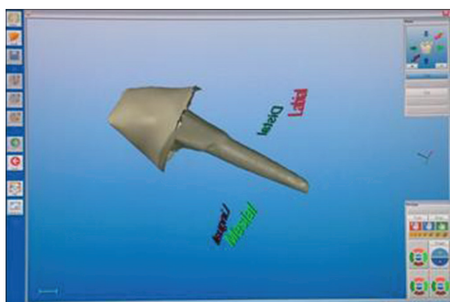
Figure 1: Aspect of Test 1 group specimen before milling

After cementation, excess cement was cleaned and all optical impressions were made with Cerec 3D inEos. 33 similar crowns were fabricated from an all-ceramic material (CerecBlocs, Bensheim, Germany) in the same dimensions with the help of software by CAD/CAM technique. The crowns were adhesively luted with RelyX ARC in accordance with the manufacturer's instructions.