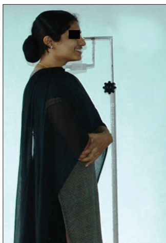
Figure 1: A scale mounted on an adjustable stand was positioned horizontally below the mandible

Sn-Me' distance was measured by hanging a vertical string with a weight (subject in natural head position), and these points were marked accordingly on the string. The marked distance is measured as the true vertical distance between Sn and Me' using digital vernier caliper. The subjects were videotaped on the same day as the measurement of LFH was taken. Both the measurements were taken by a single trained rater (principal investigator). LFH and posed SW were calculated again on 20% of the sample population and reliability of the measurements was assessed.