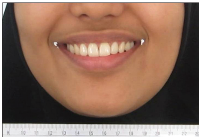
Figure 2: Posed smile photograph (obtained from video clip using free studio software)

The results were expressed as mean and SD; the mean lower facial height of females was 62.82 mm with an SD = 3.112. The mean lower facial height of males was 69.23 mm with a SD = 2.276. The difference between the above two means was significant with a t = 10.231 and P = 0.000 [Table 1]. The mean posed SW of females was 64.59 mm with the SD = 3.706. The mean posed SW of males was 69.34 mm with the SD = 3.718. There was statistically significant difference between the mean posed SW of males and females with a t = 5.653 and P = 0.000 [Table 2]. The co-relation between posed SW and lower facial height [Table 3] was done, and a statistically significant ( P < 0.01 ) result was obtained. The scatter diagram also shows this positive co-relation [Diagram 1]. The ratio of lower facial height and posed SW was calculated