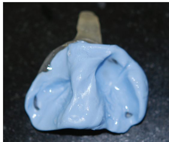
Figure 2: Maxillary arch impression using silicone impression material

The baby was seen once in 2 weeks for appliance adjustment. The plate is adjusted to facilitate the approximation of the alveolar process. The nasal