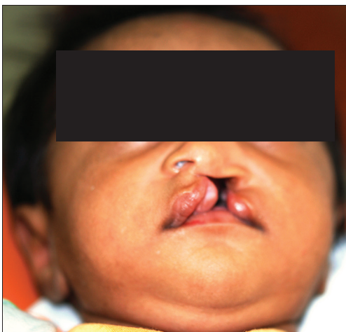
Figure 1: Baby with unilateral cleft lip and palate

The parents were asked not to feed the baby at least 3 h before taking impression. Impression was taken with the child secure in the mother's lap. Primary impression of the maxillary arch was taken with silicone impression material in a special pediatric impression tray [Figure 2]. Caution was taken to avoid any airway obstruction. After the impression had been taken, oral and nasal cavities were inspected for any residual impression material. The impression was poured in dental stone for making a working model [Figure 3].