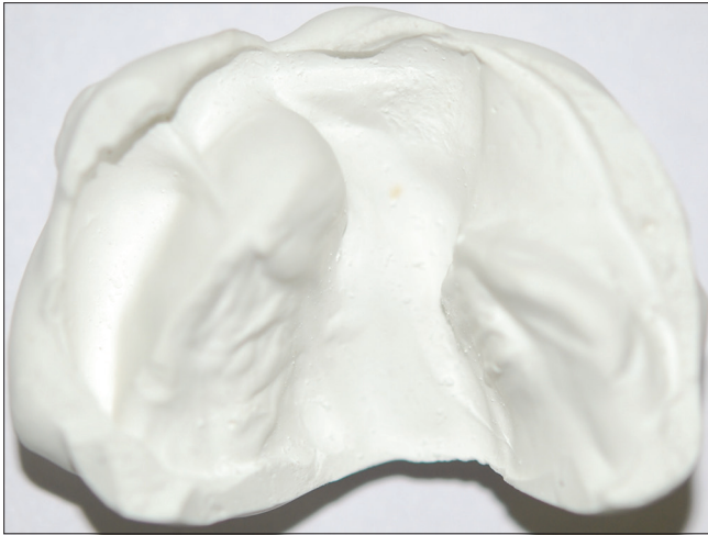
Figure 3: Stoneworking model of the cleft alveolus