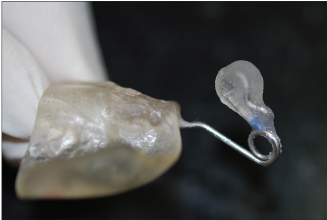
Figure 5: Modified nasoalveolar molding device with acrylic bulb

stent is adjusted to align the nasal dome, improve nasal projection, and increase the length of the columella. The adjustment of the nasal stent is done with orthodontic pliers. The parents were advised to clean the plate every day and keep the plate clean.