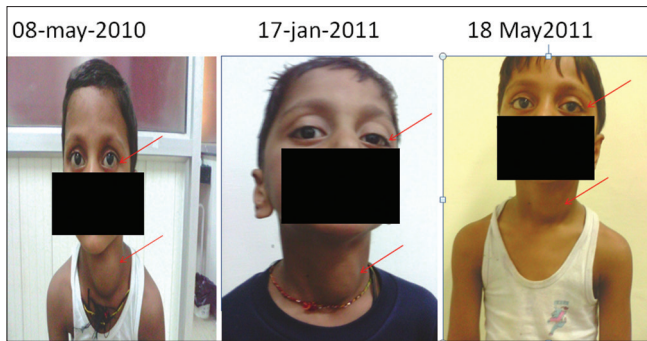
Figure 1: Clinical appearance (on treatment and follow-up)

suggestive of a hyperfunctioning nodule involving the left lobe of the thyroid.