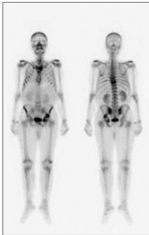
Figure 1: Scintigraphic examination of patient

pericardial effusion and subtotal collapse of right lung were noticed at thorax CT [Figure 2c]. Pericardiectomy was performed, and the effusion was hemorrhagic. No malignant cell was determined at cytologic examination, and there was no proliferation in culture of pericardial fluid. Approximately, 500 cc/day pericardial hemorrhagic fluid was drained. The bilirubin level increased up to 30 mg/dl and the patient died 20 days after the application of Sm-153.