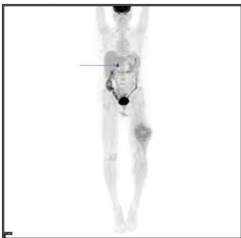
Figure 1: Whole body fluorodeoxyglucose positron emission tomography-computed tomography maximum intensity projection image demonstrating moderate-grade fluorodeoxyglucose uptake in primary soft-tissue sarcoma in the left thigh, and high-grade fluorodeoxyglucose uptake in right adrenal lesion (arrow)

STSs of the extremity are rare tumors, accounting for <1% of cancers in adults. Pulmonary metastases are common; however, extremity myxoid liposarcomas are known to have a unique extrapulmonary metastatic potential. [7] Isolated adrenal metastasis from primary STSs has previously been reported in literature without the development of pulmonary metastasis or disseminated disease. Kobayashi et al. have reported a case of bilateral adrenal metastasis with SUVs of 13.38 and 5.71 on FDG PET-CT without lung nodules at staging evaluation in a case of malignant fibrous histiocytoma of the buttock and thigh, and Mcphee et al. have reported a case of bilateral adrenal metastasis developing 16 months after treatment of primary cardiac sarcoma. Pheochromocytomas have been reported to demonstrate uptake of FDG with SUV maximum