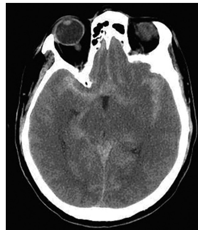
Figure 1: Subarachnoid hemorrhage (CT aspect)

Some reports showed that some protein kinases might directly interact with mitochondrial proteins in cerebral ischemia.