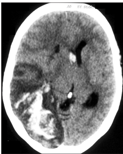
Figure 1: Plain axial CT scan shows a large right sided temporo-parieto-occipital hypodense area with foci of hyper attenuation within, suggestive of hemorrhagic transformation. The right lateral ventricle is effaced and there is evidence of subfalcine herniation and midline shift

Her thrombophilia profile which was sent on admission indicated low levels of Protein S and Antithrombin (AT) III. Other parameters were normal [Table 2].