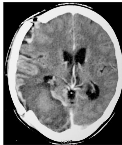
Figure 2: Post contrast axial CT scan on post operative day 5 showing extensive leptomeningeal and peripheral enhancement of the infarct. The mass effect has decreased but the occipital horn is still mildly effaced