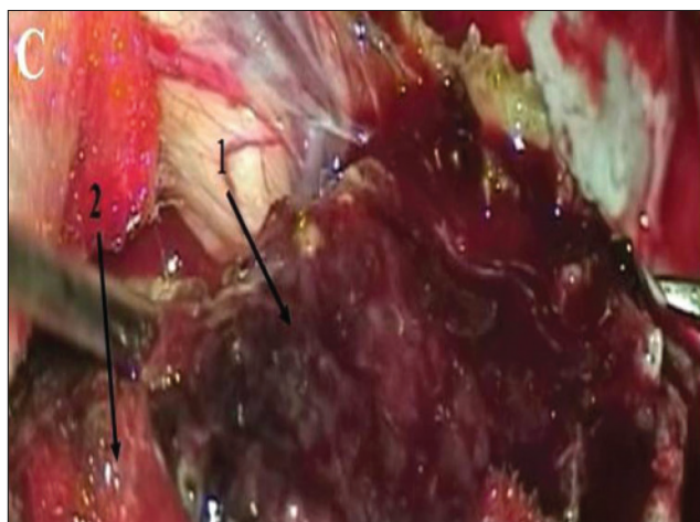
Figure 2: Intraoperative picture. Arrow no. 1 – Hematoma; 2 – Mass