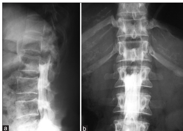
Figure 1: (a and b) Myelogram showing complete block of contrast flow at L-1 level with convex lower outline. Filum terminale was found deviated towards left and posteriorly

Dr. Satya Bhusan Senapati, Department of Neurosurgery, SCB Medical College and Hospital, Cuttack - 753 007, Odisha, India. E-mail: satya.bhusan.senapati@gmail.com