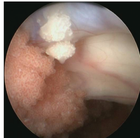
Figure 2: Two tubercles on the ventricle wall