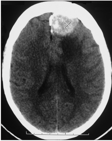
Figure 1: Non contrast computed tomogram head axial image showing a left anterior third parasagittal meningioma with turtle shell-like hyper-density (open arrow). There are hyper-dense areas within the tumor too

in osteogenesis, was expressed in ossified meningiomas of psammomatous variety. [4] However, immunochemical studies have suggested two different pathways for bone formation. [1] In most cases bone tissue arises in tumors with calcification or psammoma bodies. The bone seen in these cases is mature one as confirmed by presence of osteocalcin expression, a marker for terminal osteoblastic differentiation involved in bone maturation. [1] The remaining few cases show immature bony trabeculae with interspersed mineralizing chondroid matrix suggesting enchondral ossification. These cases were characterized by the absence of psammoma bodies (metaplastic mechanism) and expressed osteopontin, a marker of early bone formation and usually seen on precursor osteoblast cells and osteoblasts. [1] Although the ossification suggests metaplasia, osteoblastic meningiomas are considered to be grade-1 as most of the cases described in the past have shown a good outcome.