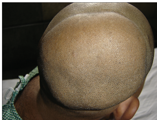
Figure 1: Photograph showing a large parieto-occipital swelling of the scalp