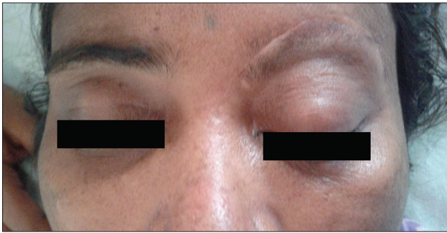
Figure 1: Ptosis and proptosis as well as scar mark of previous incision

and cavity was washed with normal saline and wound closed in layers. Postoperative period was uneventful. Patient was discharged on 10 th postoperative day with advice of albendazole (400 mg) BD for 2 months and monthly follow-up. Two month of follow-up, patient doing well and her ocular mobility and vision improved. On physical examination, no proptosis was detected. Follow-up CT-scan of the head including orbit revealed no cystic lesion except granulation tissue [Figure 3].