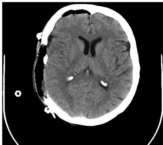
Figure 3: Post-operative CT scan of the head displaying the complete resection of the metastatic lesion replaced by a heterologous cranioplasty

metastasis was 10 months. The most common locations are pelvis, spine, and lower-extremities bones, but other sites have been rarely reported (ribs, facial bones, and skull). Sporadic