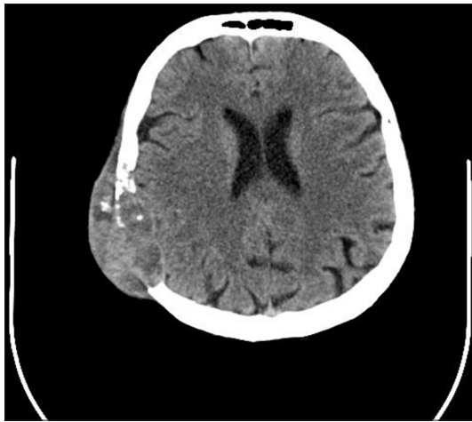
Figure 1: Pre-operative CT scan of the head showing a large osteolytic lesion of the right calvaria