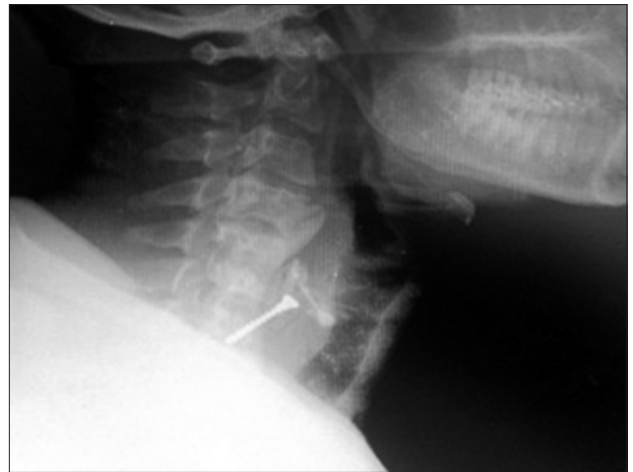
Figure 2: Sinogram lateral view