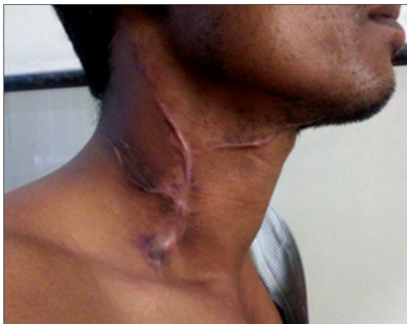
Figure 6: Healed wound and sinus