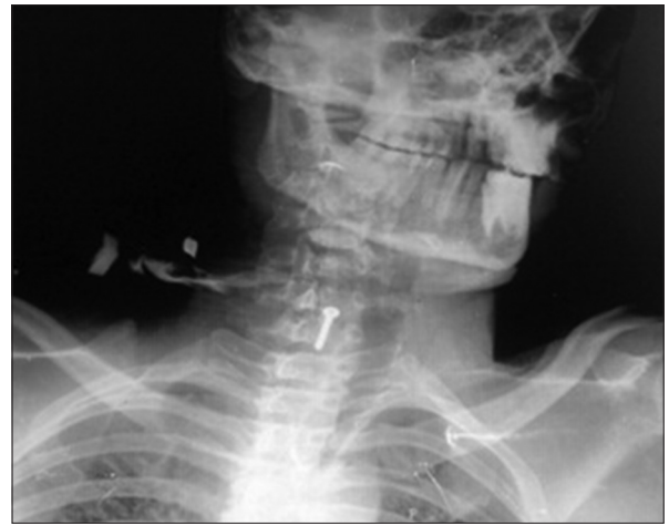
Figure 1: Sinogram showing the path of the sinus track (anteroposterior view)