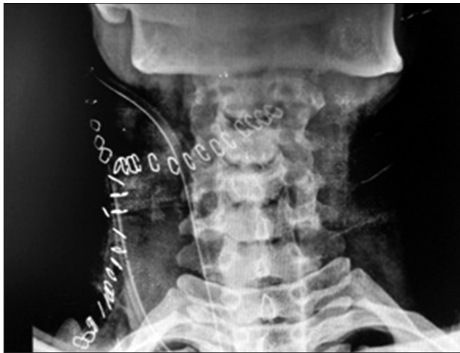
Figure 5: Postoperative radiograph after screw removal and wound closure