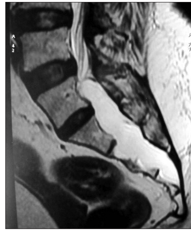
Figure 2: Magnetic resonance imaging scan (T2-weighted sequence, sagittal view) of the lumbosacral spine showing an intraspinal meningeal cyst extending from L5 to S4, extending into right neural foramina from L5 to S3 and left neural foramina from S1 to S3 with pressure erosion of the surrounding bone

A 28-year-old female presented with pain in both lower limbs for the last 2 years. The pain was more in the left lower limb and aggravated since last 6 months. It was associated with numbness on the lateral aspect of left lower limb. On examination, higher mental functions were normal. Power was normal at both knees and hips but the power of both extensor hallucis longus/flexor hallucis longus was reduced and movement was possible only against less than normal resistance (4/5 according to Medical Research Council Scale). Pain and temperature sensations were diminished along left L5-S1 dermatome by 50%. Ankle reflex was diminished on the left side. The rest of the reflexes were normal, and both the plantar reflexes were down going. X-ray of the lumbosacral spine was suggestive of spondylolysis of pars interarticularis