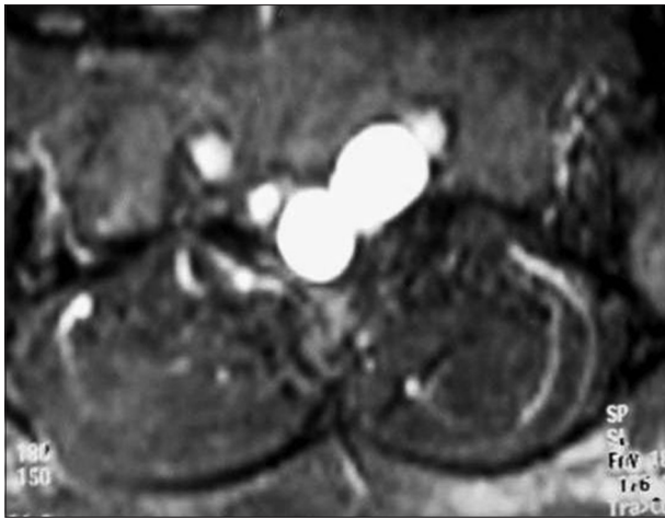
Figure 3: Magnetic resonance imaging scan (T2 weighted sequence, axial view) of the lumbosacral spine showing a well-defined cystic lesion along the traversing left L5-S1 nerve root suggestive of perineural cyst