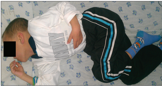
Figure 1: A patient presented with nuchal rigidity