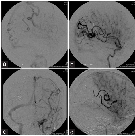
Figure 3: (a) After opening the left transverse-sigmoid sinus, the venous reflux decreases significantly. (b) The embolization further decreases the arteriovenous (AV) shunting. (c and d) The follow-up angiography shows no residual AV malformation and patent transverse-sigmoid sinuses

sagittal sinus and left a vein of Labbé. This transmitted the pressure to the left cavernous sinus and caused left superior ophthalmic vein engorgement. Treating this kind of AVM requires extra considerations. The high-flow fistula posed additional risk of perioperative bleeding, and preoperative embolization is often considered of utmost importance. [4,5] However, when performing embolization, care must be taken since overshooting the shunting zone into the drainage veins and reflux into the already hypertensive cortical veins is possible. A series of 13 cases of AVM with venous anomaly and brain edema has been reported. [5] Seven patients underwent embolization, and one of them had further surgical resection. Four patients including the one had surgery suffered from ICH. Two had NBCA reflux from the high-flow shunt into the dilated venous sac and resulted in ICH within 24 h after the procedure. The one underwent surgery had total AVM excision, but postoperative venous congestion and ICH occurred 1-day later. He concluded that the increasing the efficiency of venous outflow could decrease the venous hypertension, and this is a possible treatment choice to manage this kind of AVM.