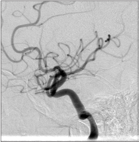
Figure 3: Second postoperative day angiogram showing a complete resolution of the pouch and disappearance of the pseudoaneurysm