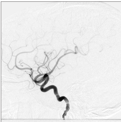
Figure 5: Angiogram after pipeline embolization device placement shows no evidence of stenosis, proximal, distal, or within the device, and there is no evidence of embolus or occlusion at any of the intracranial vessels

with PED was successful [Figure 5] and the patient remained neurologically stable after the procedure.