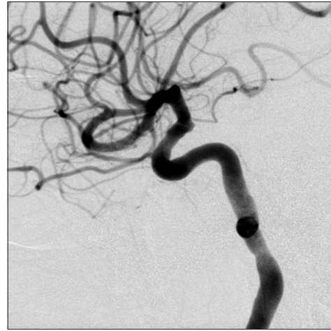
Figure 2: Perioperative angiogram showing a small pouch suggestive of pseudoaneurysm, just below the level of the takeoff of the left anterior choroidal artery