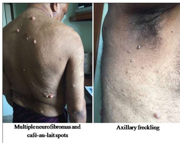
Figure 1: Multiple neurofibromas, café-au-lait spots and axillary freckling

Zhu et al. reported that in their mouse model with NF1 and simultaneous loss of p53, most tumors arose in the vicinity of the subventricular zone (SVZ), where the majority of neural precursor cells reside. [6] This indicates: