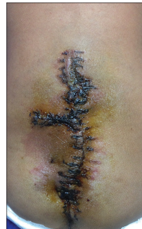
Figure 3: Postoperative image showing healed wound

As per Pang's hypothesis, [10] the core structure of TMC strikingly resembles a transitory stage of late secondary neurulation in chicks in which the cerebrospinal fluid-filled bleb like distal neural tube bulges dorsally to fuse with the surface ectoderm before focal apoptosis detaches it from the surface and undertakes its final dissolution. TMC results