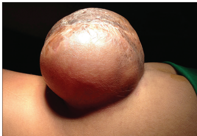
Figure 1: Preoperative image showing a large lumbosacral skin covered mass