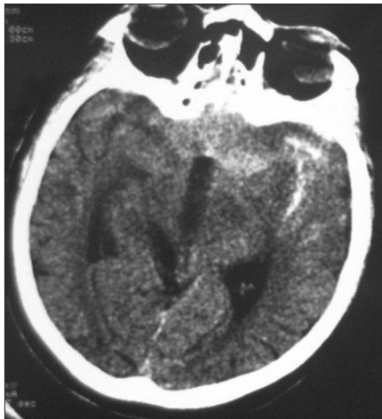
Figure 1: Computed tomography an image consistent with extensive subarachnoid hemorrhage on the left sylvian cistern was detected