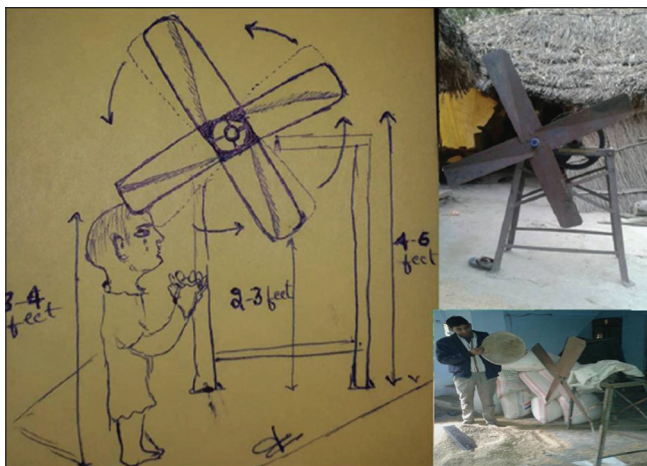
Figure 3: Left-hand: Author sketch on an approximate height of the machine and the patients. Right-hand upper inset: Winnower machine. Right-hand lower inset: Machine being used for winnowing

Six (66.6%) patients developed complications in the perioperative period. Postoperatively two patients needed