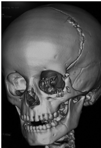
Figure 5: Noncontrast computed tomography with three-dimensional reconstruction showing classically depressed fracture with fracture line extending onto the left orbital wall

lumbar drain (surgeware) for wound site CSF leak; and for CSF otorrhea [Table 2]. Wound infection occurred in 2 (22.2%) patients with Staphylococcus Aureus growth on culture. One of them also had subdural empyema with a base of skull dural tear at temporal region which was closed with fascia lata graft and glue. This patient was started on imipenem and vancomycin as per culture sensitivity report. Pus did not yield any fungus or mycobacterial growth. Both recovered well. No mortality was noted. Wound dehiscence occurred in four patients (44.4%) requiring resulting. Two patients showed considerable improvement of hemiparesis (power 4/5) in postoperative period. Both patients with globe injury persisted to have vision loss at the time of discharge. Two patients had postoperative seizure in spite of phenytoin but did not recur. Only one patient in low GCS showed improvement at the time of discharge.