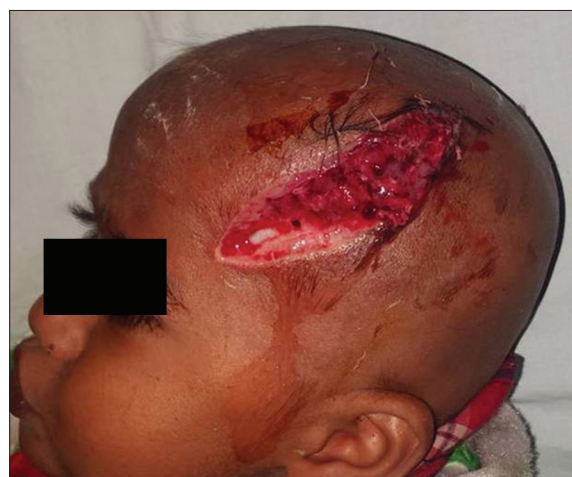
Figure 2: Left frontal compound depressed fracture with brain matter leak with evident vegetable matter

the compound depressed fracture. All patients had vegetable material, straw and sand particles in the wound. Depressed fracture involved mainly the frontal bone ( n = 6 ), parietal bone ( n = 2 ) and temporal bone ( n = 1 ). Three patients had