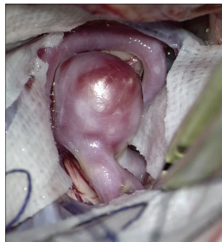
Figure 2: Intraoperative image of the same aneurysm with thinned wall