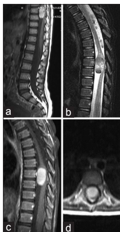
Figure 1: Magnetic resonance imaging revealed T8-9 intramedullary mass showing increased signal intensity in both T1-weighted (a), T2-weighted (b) weighted images and contrast enhanced T1-weighted sagittal (c), axial (d) weighted images