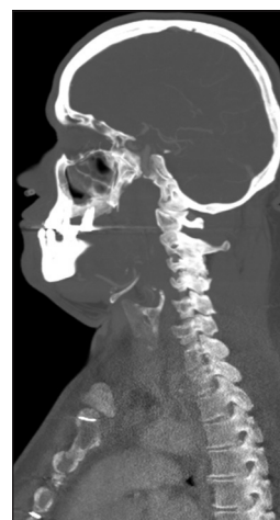
Figure 2: Sagittal computerized tomography revealing C2–C3 fusion and obliteration of C3–C4 transverse foramen