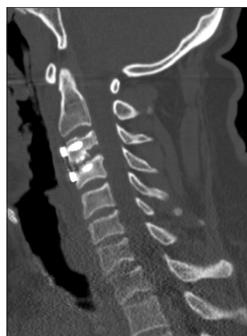
Figure 6: Sagittal computerized tomography after anterior cervical discectomy and fusion at C3–C4

The symptoms associated with vertebrobasilar insufficiency as manifested in Bow Hunter's syndrome range from asymptomatic to life-threatening. Patients who are successfully treated with medical therapy including anticoagulants may remain symptom-free for undetermined periods of time; however, the underlying pathology behind the symptoms can only be corrected with surgical treatment. Accurate anatomical knowledge is of the utmost