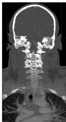
Figure 1: Coronal computerized tomography revealing C2–C3 fusion and obliteration of C3–C4 transverse foramen

Conservative options are available for the treatment of Bow Hunter's syndrome and involve behavioral modifications, restrictive braces, cervical traction, as well as the use of