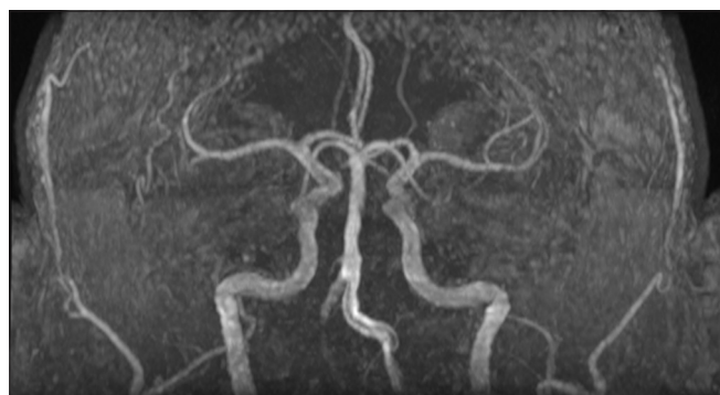
Figure 3: Magnetic resonance imaging of brain showing hypoplastic right vertebral artery