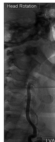
Figure 4: Dynamic fluoroscopy of the left vertebral artery showing obliteration of the left vertebral artery flow with head rotation to the left