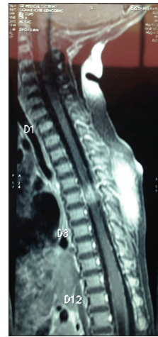
Figure 2: Magnetic resonance imaging dorsal spine T1-weighted imaging contrast sagittal view