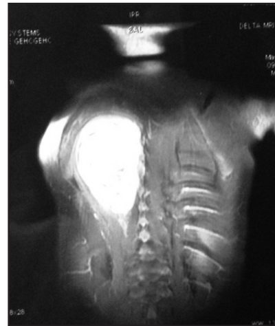
Figure 4: Coronal view