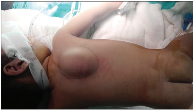
Figure 1: Preoperative photo