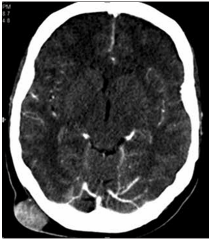
Figure 1: Computed tomography scan of subcutaneous mass