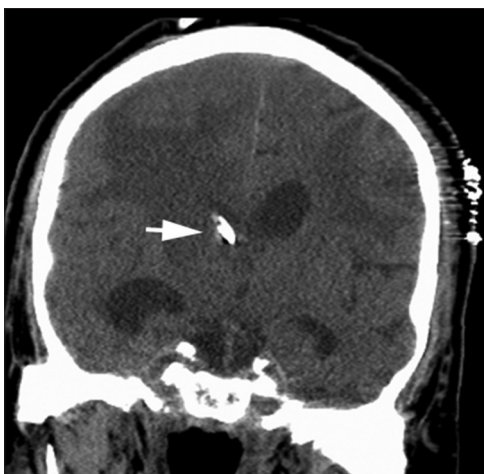
Figure 3: Computed tomography of head without contrast coronal view shows location of the catheter tip within the ventricle, denoted by the arrow

septation and organized debris; this cascade elicits barriers that impede the penetration of IV antibiotics to the ventricular system, where infectious nidus may exist. [27] This may explain the persistently positive CSF cultures despite prolonged IV antibiotics. With intraventricular vancomycin, the antibiotic comes into direct contact with the intraventricular infection [Figures 2 and 3]. The administration of intraventricular antibiotics can control infection, reduce inflammation, and prevent ventricular septation. [8] Clinically, our patient improved gradually with the commencement of intraventricular therapy, and the infection was eventually eradicated.