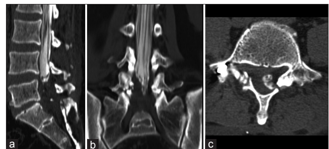
Figure 2: (a-c) Sagittal, coronal, and axial computed tomography myelogram images showing abrupt cutoff of thecal sac at L5 vertebral level, leftward displacement of thecal sac

The L5 nerve root compression was relieved after removal of fragment. However, compression of the right L5 nerve root by ballistic fragment alone could not explain the severe presurgical right lower limb (thigh, knee, and