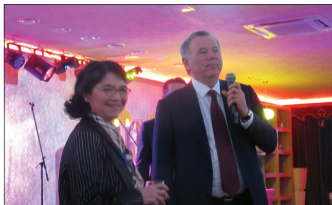
Figure 3: International Neurosurgery Forum: WFNS Education Course. Conference “Sport and Neurotrauma” in Sochi, Russia on 26–27 February 2016

He was the chairman of the Scientific & Organizing Committee. Many distinguished faculty members attended