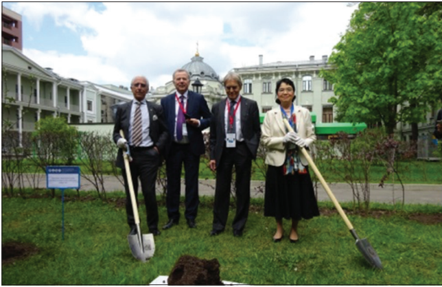
Figure 4: International Neurosurgical Forum and the WFNS Course, Moscow, Russia, on 18–20 May 2017