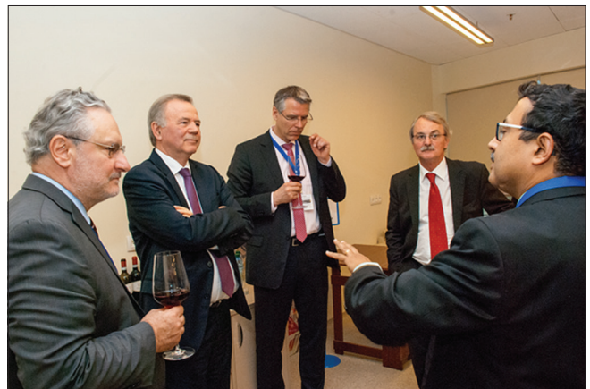
Figure 7: WFNS Educational course in conjunction with the 4 th ISMINS Congress in Moscow on 19–21 April 2018