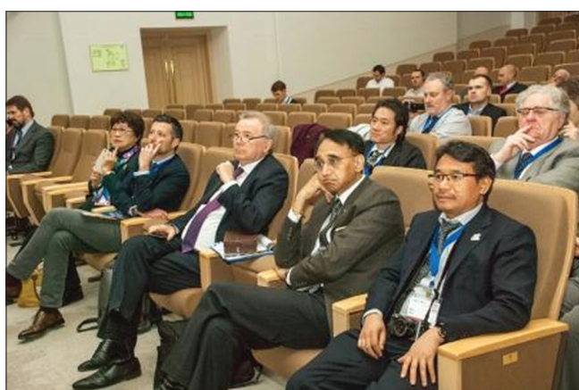
Figure 12: WFNS Educational course in conjunction with the 4 th ISMINS Congress in Moscow on 19–21 April 2018