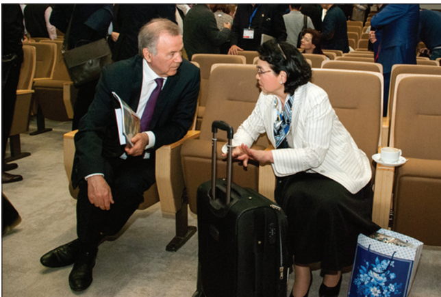
Figure 6: WFNS Educational course in conjunction with the 4 th ISMINS Congress in Moscow on 19–21 April 2018