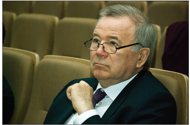
Figure 5: WFNS Educational course in conjunction with the 4 th ISMINS Congress in Moscow on 19–21 April 2018