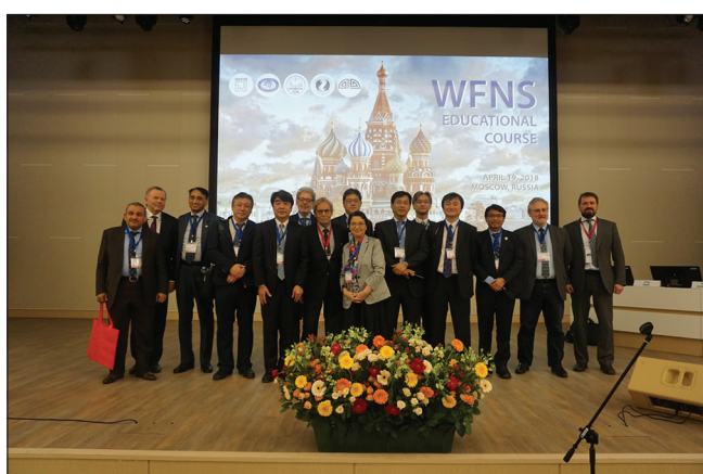
Figure 14: WFNS Educational course in conjunction with the 4 th ISMINS Congress in Moscow on 19–21 April 2018