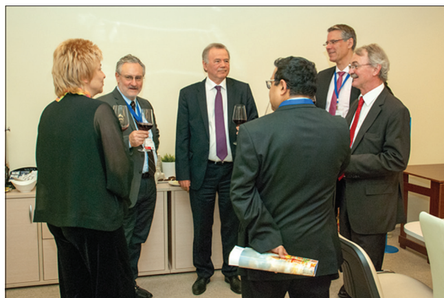
Figure 11: WFNS Educational course in conjunction with the 4 th ISMINS Congress in Moscow on 19–21 April 2018