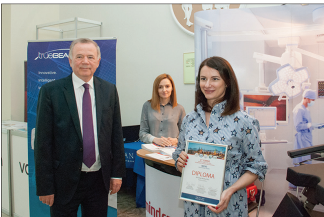
Figure 8: WFNS Educational course in conjunction with the 4 th ISMINS Congress in Moscow on 19–21 April 2018