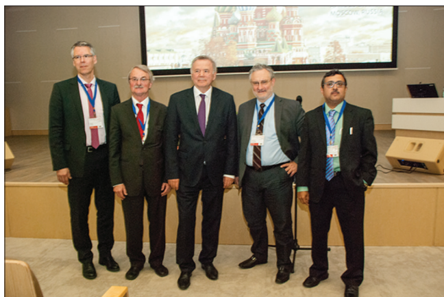
Figure 10: WFNS Educational course in conjunction with the 4 th ISMINS Congress in Moscow on 19–21 April 2018