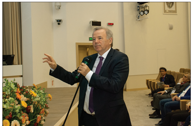
Figure 9: WFNS Educational course in conjunction with the 4 th ISMINS Congress in Moscow on 19–21 April 2018

According to the charter of the Academy, his role as academician is to enrich science with new achievements. [4]