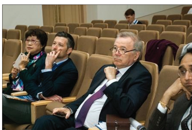
Figure 13: WFNS Educational course in conjunction with the 4 th ISMINS Congress in Moscow on 19–21 April 2018