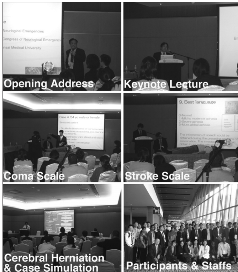
Figure 1: The scenery of international Primary Neurosurgical Life Support course in 9 th Asian Congress of Neurological Surgeon in Kuala Lumpur on November 22, 2010