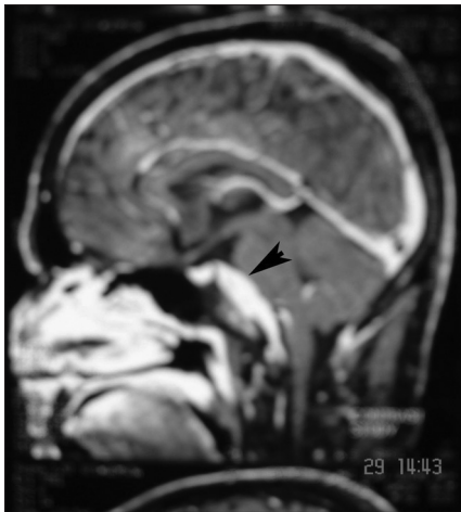
Figure 1: T1 weighted postcontrast sagittal images are showing thickened dura matter at the base of skull pointed by the arrowhead