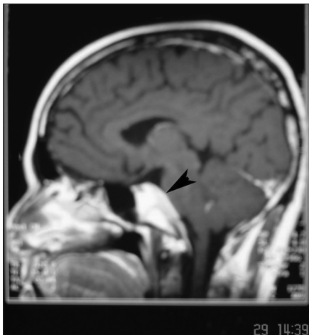
Figure 3: Not much changes are seen in comparison to Figure 1 after full course of antitubercular treatment