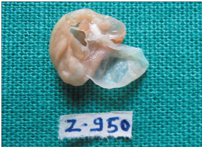
Figure 2: A 1.5×1.0×0.8 cm septate cystic lesion with a whitish nodule; cyst wall was thin, shiny, and grayish white