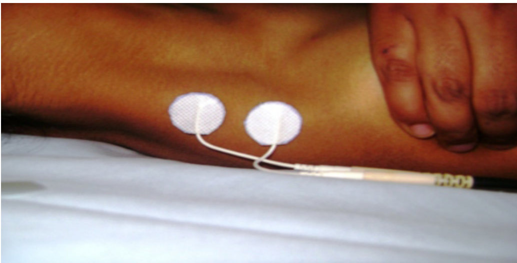
Figure 1. Placement of EMG electrodes at the upper trapezius

Despite the widespread use of upper limb neural tension test, the neurophysiological basis for sensory and motor responses produced during the test remain controversial (19,20). It has been suggested that increased muscle activity evoked during the upper limb neural tension test may be a withdrawal response to pain that acts to indirectly protect the nerve by preventing further tensioning, but this concept has recently been challenged (20,21). It is not certain