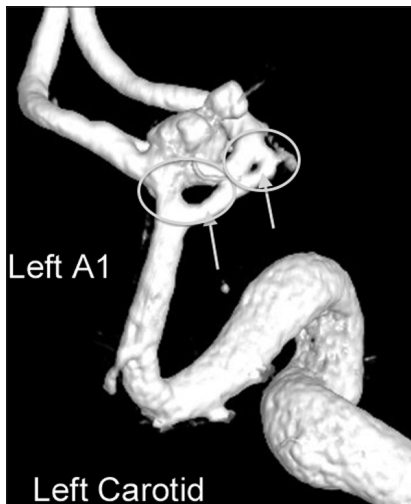
Figure 1: 3D-RA of left carotid injection showing a large necked aneurysm involving the ACoA and left A2 with a double fenestration in the ACoA—the “figure-of-8” anomaly

The patient was a 23-year-old male who presented with clinical and radiological features of subarachnoid hemorrhage. A four-vessel conventional angiography showed an anterior communicating artery (ACoA) aneurysm filling from the left A1 with a hypoplastic right A1 segment. Three-dimensional rotational angiography (3D-RA) reconstructions revealed a double fenestration in the ACoA with the aneurysm arising from the distal channel of the ACoA and incorporating the wall of the left A2 segment [Figure 1]. This we called the “figure-of-8 anomaly.” The patient underwent a left pterional craniotomy, transylvian approach, and clipping of the aneurysm. A thinned out hypoplastic right A1 segment was identified along with a double fenestration of the ACoA. The aneurysm was secured with two 7-mm straight mini clips with one blade of each clip passing through the left fenestration and trapping the aneurysm [Figure 2a-c]. The patient